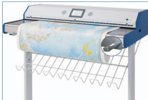
Walk up scanning to USB stick

The integrated walk-up scanning software makes the scanner a truly shared device. It allows the user to scan and send images to a specific destination such as a network printer, any directory in the network, or to a USB stick; without having to work with a client PC. Simply walk up, scan and store or send the image, all through the use of the touch screen.