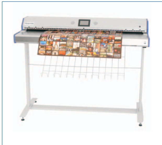
The new wide format scanner WideTEK 48

The exceptionally high scanning speed, dust-protected and encapsulated optical components and the absence of consumables characterize this highly efficient production-ready device. With a life expectancy of over one million scans, the WideTEK 48 redefines the price/performance ratio in the wide format scanner market.