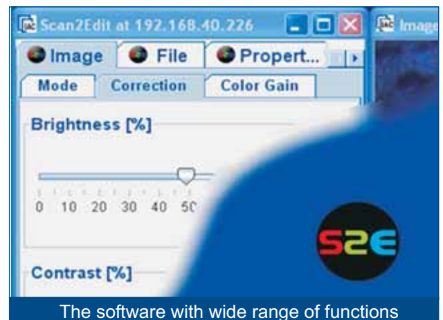
The software with wide range of functions

Scan2EDIT enhances and complements the Scan2Net® functionality. The software is free of charge and is available for download online in the Image Access Customer Service Portal .